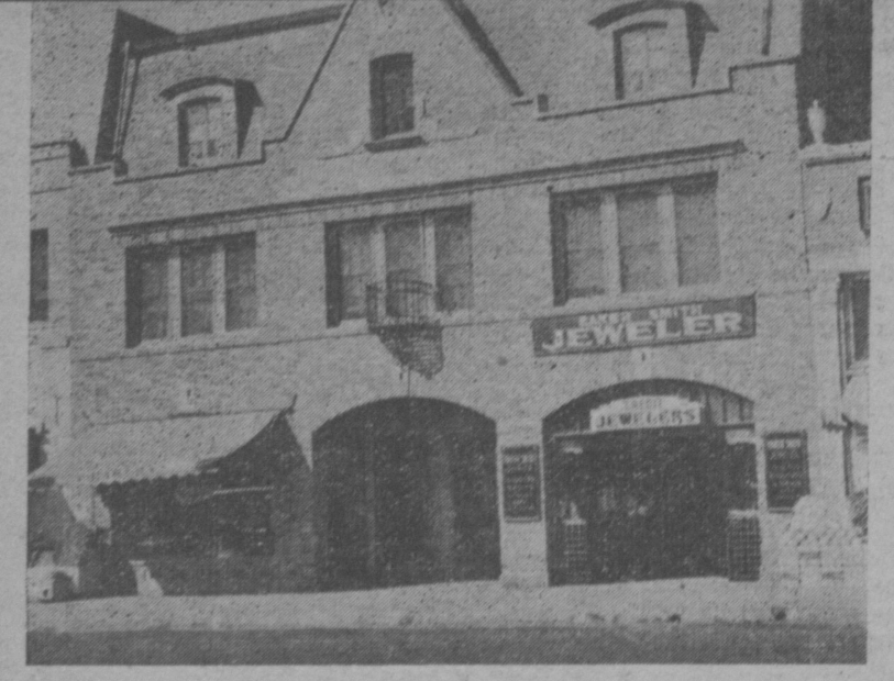
Masonic Organizations Have Own Temple.