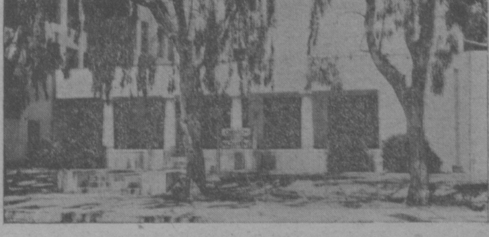
Church of the Nazarene.

Completing the list of Torrance churches, a stake of the Latter Day Saints holds services in the Woman's Club building. Its services were formerly held in American Legion