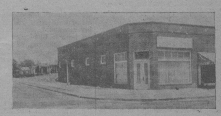
Four Square Church.