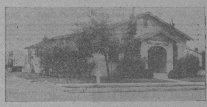
First Lutheran Church.