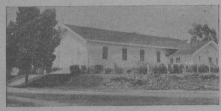
Church of the Nativity.