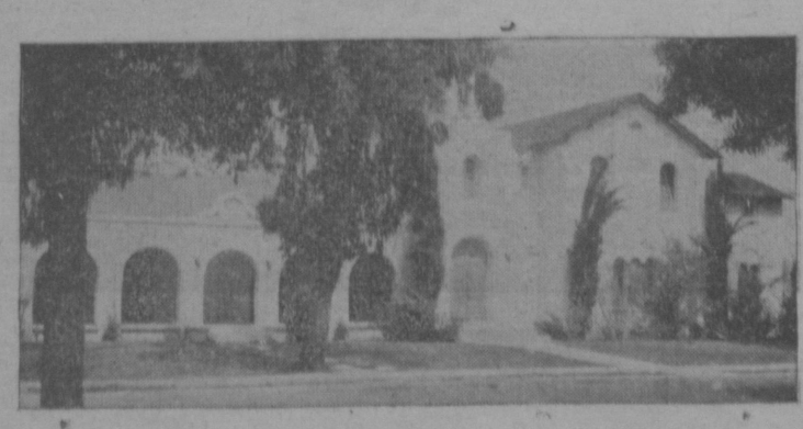
First Methodist Church.