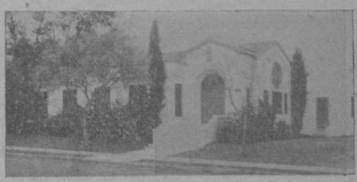
First Christian Church.