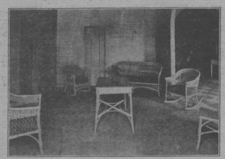
Reception Room of Hospital.

Fifty beds constitute the ca-Planned at the time to be as pacity of the hospital, which modern as medical and archi- serves a territory far greater