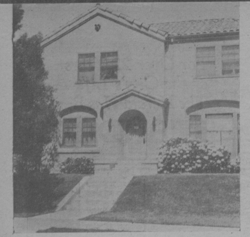
Where the Nurses Reside.

He Wanted to Give It to the City, So His Heirs Followed His Desires