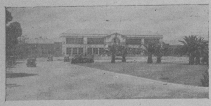
Torrance High School.