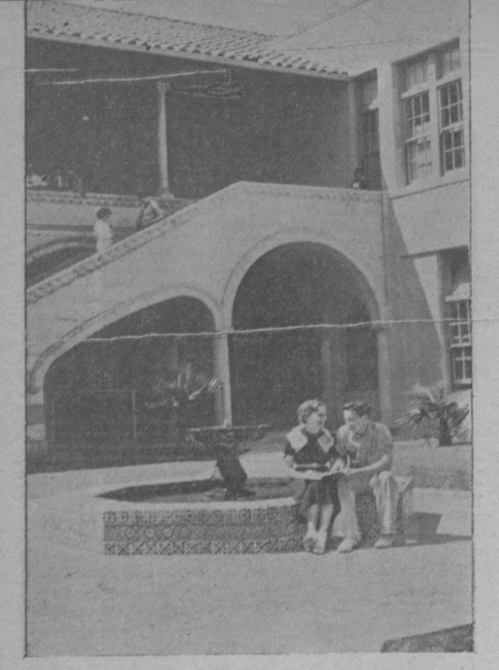
Patio at High School Presents Quite a Contrast From "Little Red house.'