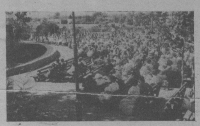
Audience Packs Seats for . . .