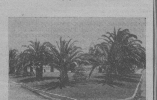
A Neighborhood Spot.

The Municipal park is now in charge of a committee con-