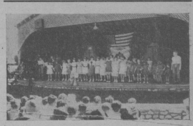
Outdoor Theatrical Performance.