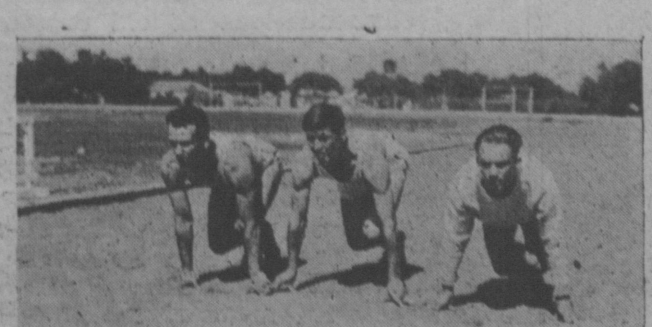
"On Your Marks; Get Set . . ."