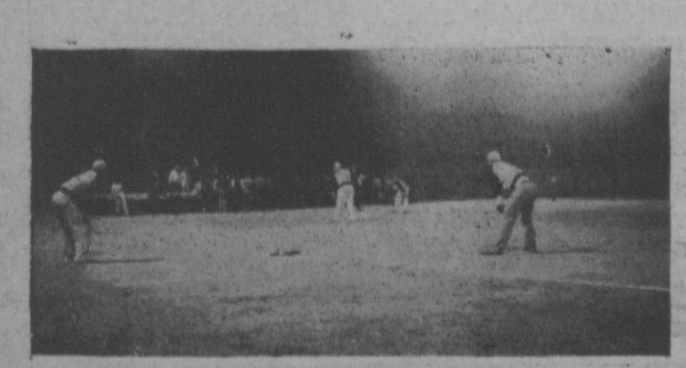
Men Play Ball at Night.

Drillers sometimes run into other things besides sand and hard rock. One of the most unusual cores ever attained was found near Torrance in 1924 when a drill crew from the Superior Oil Co. ran right TORRANCE is proud of her through the heart of a giant