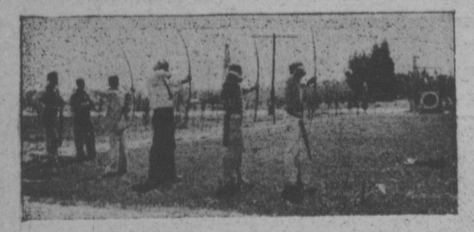
A Champion Archer Teaches the Boys.

Almost any kind of recreational activity within short distance of city.