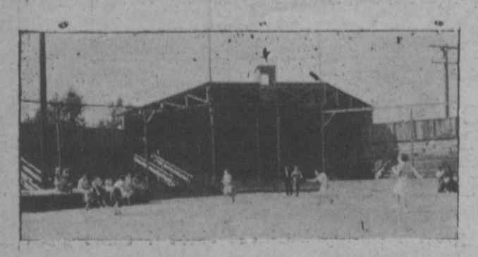
The Girls Try It by Day While . . .