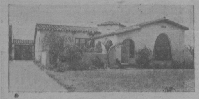
2030 Redondo Beach Boulevard.