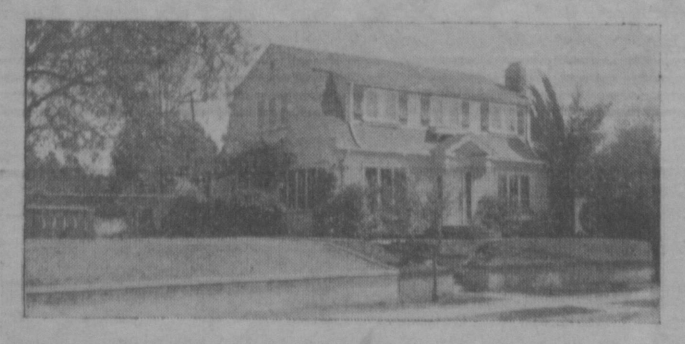
1512 Post Avenue.