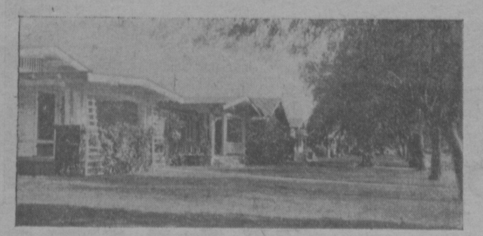
The 2000 Block on Gramercy Avenue.