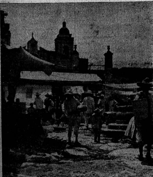
Marketplace at Oaxaca, State of Oaxaca

Promotion of friendly relations between the United States and Mexico and improvement in understanding among the peoples of the two nations form the objective of the Hollywood Chamber of Commerce good-will automobile tour to Mexico City. The party is open to any congenial person who may travel either in his own