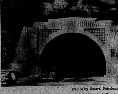
ABOVE—Southern California tunnel on Sepulveda boulevard. It gives access to the valley highway, No. 99, from south and wast coast cities and resorts. 1.50 Mile