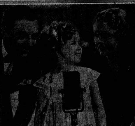
SHIRLEY TEMPLE has ALICE FAYE to hi-de-ho with and JACK HALEY to tap-a-toe with in "The Poor Little Rich Girl," her new Fox hit which is being hailed as the greatest triumph of the little star.

The state of Texas, foiled in an attempt to "adopt" Shirley Temple by the adroit maneuvering of Gov. Frank Finley Merriam of California, decided to do the next best thing by the Twentieth Century-Fox starlet.