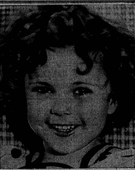
Shirley Temple, vivacious, lovable, child personality, comes to the Plaza, Hawthorne, in "The Poor Little Rich Girl" Sunday for a continuous run thru Labor Day.