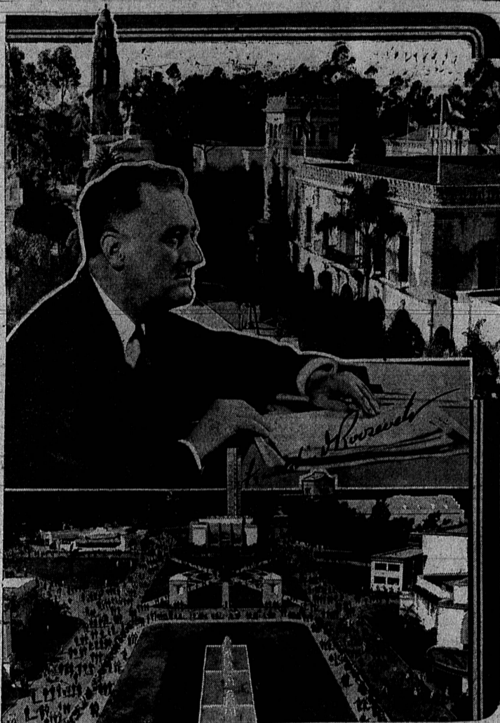
President Franklin D. Roosevelt will visit the California International Exposition at San Diego about Sept. 28. On his first visit to California since his election, the President will be greeted by one of the largest throngs yet to attend the great $20,000,000 show. A glimpse of the tree-bordered Avenue of Palaces is seen in the upper photo, with the tile-topped California Tower at the upper left.