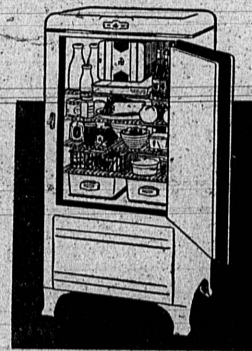
GIBSON Prices Start At