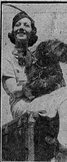
Lily Pons, golden-haired soprano, is temporarily forsaking the Metropolitan Opera Company for the sound camera. Here is the famed opera star as she arrived in Hollywood for her movie debut.