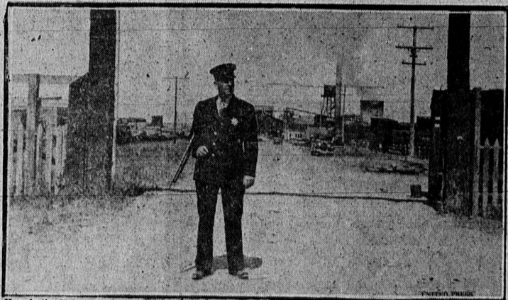
Here is the Holmes-Eureka Lumber Mill at Eureka, Calif., scene of the battle between strikers and police. Ten men were wounded and one killed when picket lines attempted to charge the mill.

Height of Optimism Reached QUESNEL, B. C. (U.P.)—The world's greatest optimist lives here. He entered his name on a ten-cent chain letter and then went to a bank and applied for a