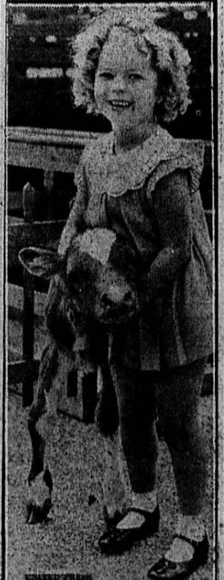
Tillie from Tillamook, a pure-bred Jersey calf, is welcomed to Hollywood by her new owner, Shirley Temple. The calf is a gift to the baby screen star from the school children of Tillamook, Ore.