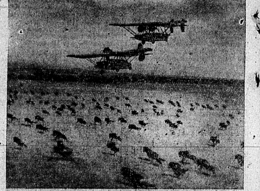
A herd of African buffalo in full flight before the planes of Mr. and Mrs. Martin Johnson, intrepid African adventurers whose latest film, "Baboonia," is released by Fox. 60,000 miles were covered by the Johnsons in making this aerial epic—and it was two years in the filming.

When Mr. and Mrs. Martin Johnson returned from Africa recently with their latest jungle film, "Baboonia," coming Sunday and Monday to the Torrance Theatre, they knew that they had some 170,000 feet of scenic and animal "shots." But they didn't know what highlights would supply the theme of their picture.