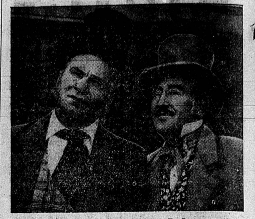
Wallace Beery as the shrewd Phineas T. Barnum, self-styled "Prince of Humbugs," and Adolphe Menjou as Mr. Walsh, his stippling aide in 20th Century's "The Mighty Barnum," which comes Sunday, Monday and Tuesday to the Lomita Theatre. On the same bill at the Lomita Theatre, starting Sunday, will be seen Constance Bennett and Herbert Marshall in "Outcast Lady."