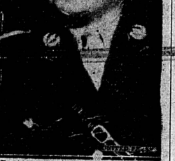
Executed Capt. Ernst Boehm, national commander of the Nazi Storm Troops and one of the most advanced radicals, who was deposed and executed in Adolph Hitler's clean-up of those who opposed the chancellor's regime.

Mystery Field The field is unlike any other known gas field in the world. The entire area is overlaid with a series of basaltic flows, ranging in thickness from a few feet to more than 100 feet. The average depth of more than 2500 feet. These flows are interspersed with volcanic ashes and sedimentary deposits. The gas now being produced is found in a very porous stratum of basalt and not in the layers between the basaltic flows. Geologists think the gas flows from some deep horizon up the line of a faulted structure to where it encounters the porous basalt, which serves as a very large reservoir. The new well is being sunk in an effort to discover this mysterious gas source.