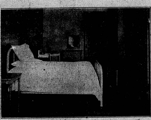
TYPICAL PRIVATE ROOM