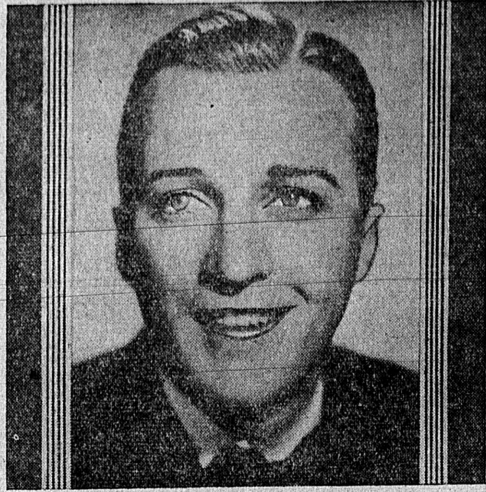
Bing Crosby in "We're Not Dressing"