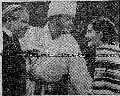
Skets Gallagher, Robert Montgomery, Norma Shearer in "Riptide"