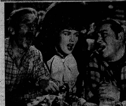
Walter Brennan, Frances Farmer and Edward Arnold hit a few high notes in Edna Ferber's "Come and Get It!" opening Thursday night at the Torrance theatre.