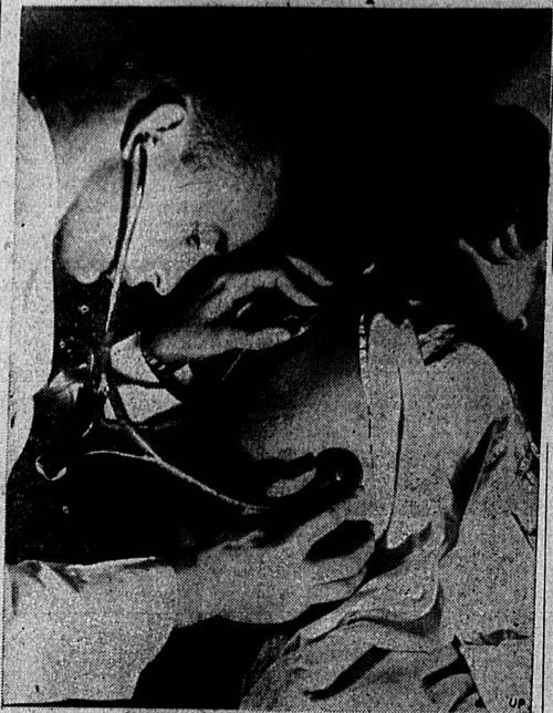
Doctors of the University of California announced they had perfected a new medical device, a two "microphone" stethoscope. The Berkeley, Cal., scientists said the apparatus would aid materially the diagnosis of lobar ailments.