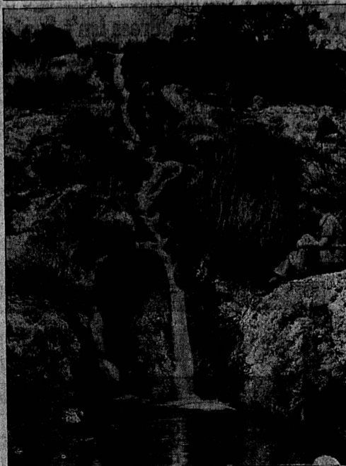
Sparkling mineral water—85 inches—running to waste in a region where thirst has killed hundreds, traced by Automobile Club of Southern California scouts. It originates in a thermal spring at the base of the Amargosa Range six miles north of Furnace Creek and the Inn, and leaps nearly 100 feet. Formerly big, hard sheep trails to it, now wild burros haunt it, while tourists are just appearing.