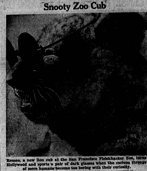
Remco, a new lion cub at the San Francisco Fleishacker Zoo, turns Hollywood and sports a pair of dark glasses when the curious throngs of mere humans become too boring with their curiosity.