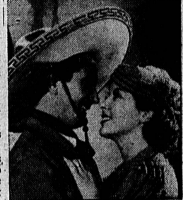
Nino Martini and Ida Lupino love in bandit lair

Martini and Ida Lupino fall in love and he manages to escape