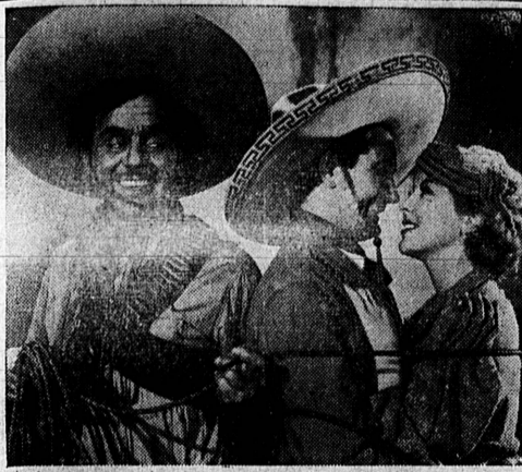
Leo Carrillo plays Cupid to Nino Martini, famous singing star, and his lovely leading lady, Ida Lupino, in "The Gay Desperado," opening next Wednesday at the Torrance theatre.

Something decidedly different in pictures with music comes to the Torrance theatre next Wednesday when "The Gay Desperado" begins a four-day engagement with Nino Martini, great singing star of radio, opera and films in the title role, and Ida Lupino and Leo Carrillo in supporting parts.