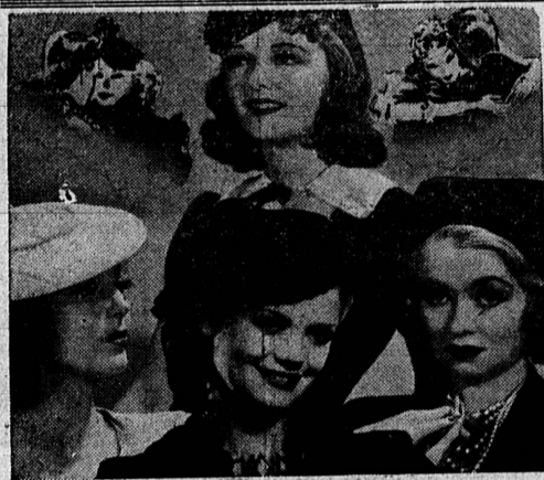
These fascinating four look for romance in "Ladies In Love," opening tonight at the Torrance theatre. Top center, Janet Gaynor, and bottom (left to right), Loretta Young, Simone Simon and Constance Bennett, the most unusual combination of feminine personalities ever to appear in one film.

With the most exciting and brilliant star combination ever to appear in one picture, "Ladies In Love" opens tonight at the Torrance theatre, a bitter-sweet romance of four lonesome, lovely girls, and their adventures in search of love.