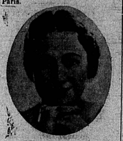
"Her eyes are her personality"

THE first indication of the personal tastes and preferences which have caused Mrs. Simpson's spectacular success in London society, comes with a United Press release about the new winter wardrobe being created for her in Paris.