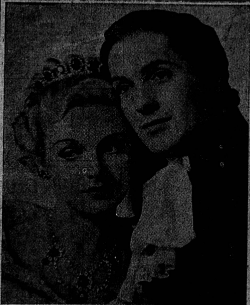
Tyrone Power and Madeline Carroll in 20th Century-Fox's photoplay, "Lloyd's of London", having its World Premiere at the Carthay Circle Theatre on November 25th.

THEY'LL GLITTER IN WORLD PREMIERE TWO DOUGHNUTS FOR MADAME!