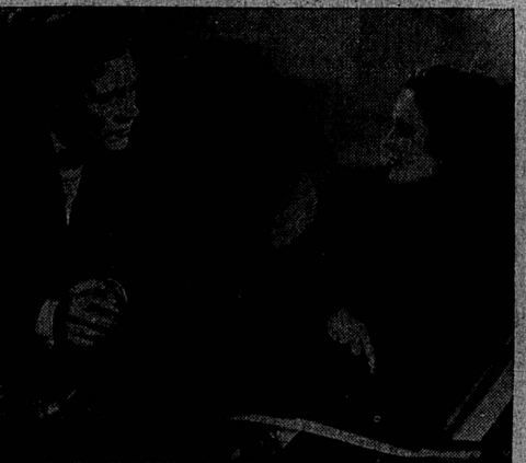
Walter Huston and Mary Astor in "Dodsworth," a Samuel Goldwyn production released through United Artists

Sinclair Lewis' "Dodsworth," which thrilled millions as a novel and as a stage play, now comes to the screen in Samuel Goldwyn's film production which begins a three-day run at the Plaza theatre, Hawthorne, Thursday, with Walter Huston, Ruth Chatterton, Paul Lukas, Mary Astor and David Niven in the leading roles.