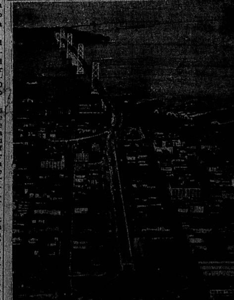
San Francisco-Oakland Bay Bridge its human side is plot for sound movies

Rotary to Show Bridge Movies U. S. Steel Film Open to Public, Dec. 3