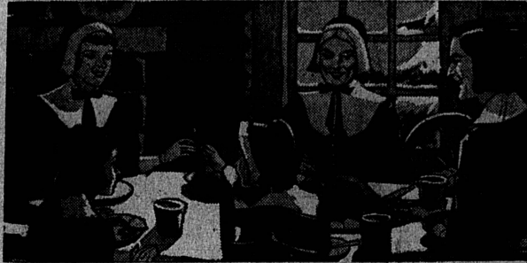
They left a historic legacy that