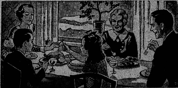
flourishes over a thankful nation today.

The Thanksgiving Day celebration had its inception in 1621, following the first agricultural harvest of the Pilgrim Fathers at Plymouth. The actual day of early winter has been forgotten, but it is known that three days before the fasting and prayer and the subsequent feast, the famous Gov. Bradford sent four men into the snow-carpeted forest to shoot game for meat. They returned with a sleighful of wild turkeys. As there was no fruit, it was natural that the cranberries from the wild cranberry bogs of Cape Cod were used to "balance" this part of the diet. The thrifty Mayflower women saw to that. Turkey and cranberries is a legacy from the Pilgrims.