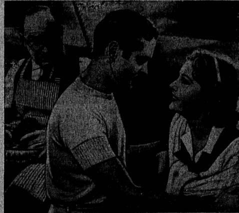
Robert Montgomery and Madge Evans in a scene from "Piccadilly Jim"

Hollywood's adaptation of the P. G. Wodehouse comedy, "Piccadilly Jim," opens at the Plaza theatre Sunday.