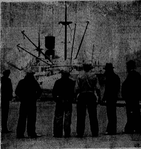
On San Francisco's waterfront, pickets marched as the city of the Golden Gate became the focal point of a strike of 37,000 maritime and ship workers. These labor sentinels stand before the United Fruit Co.'s "Chiriqui."