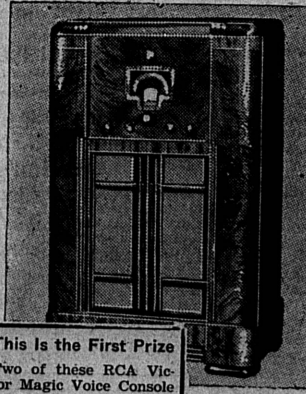
This is the First Prize

This is a contest with thousands of prizes. In your section of the country two Magic Voice console radios and 2,040 other prizes are guaranteed each week. Hear the Magic Voice! Win a prize.