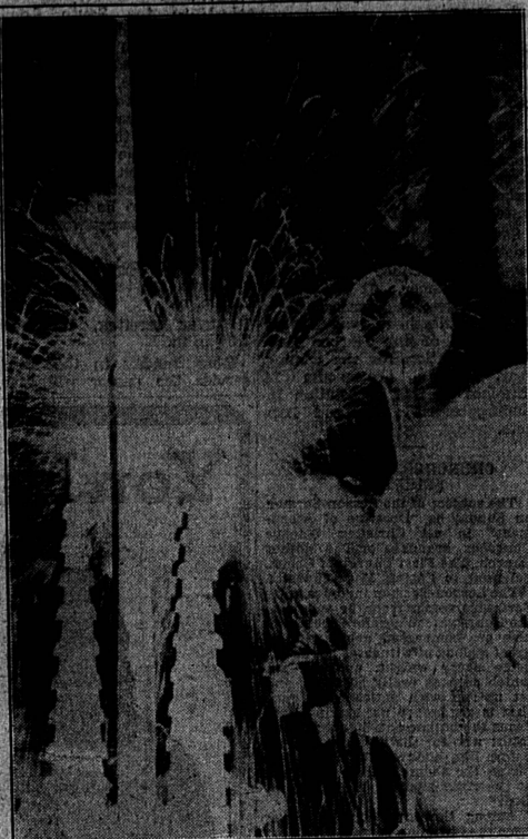
Electric sprays, synthetic thunder storms and striking demonstrations of static electricity provide novelty and surprises for throngs at the Electrical Age Exposition, running until Sunday night, October 18, in Pan-Pacific auditorium, Los Angeles. Above photo shows some of the spectacular demonstrations.