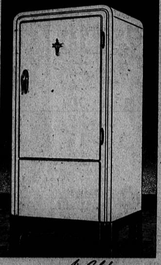
NEW Air-Cooled ELECTROLUX THE SERVICE REFRIGERATOR

And best of all... ELECTROLUX PAYS FOR ITSELF IN SAVINGS!