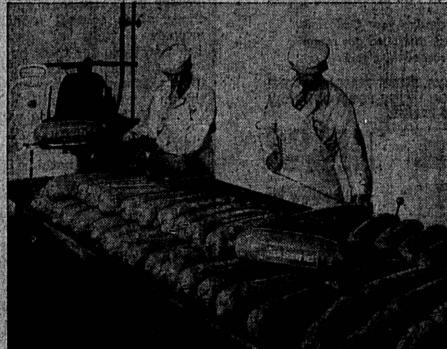
PACKING GROUND BEEF IN SAFEWAY'S BOTTLERS PLANT.