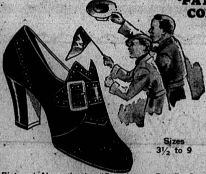
Pictured Above is the "Guardman Boot"—One of the New Numbers in the Group—to Sell for $2.45