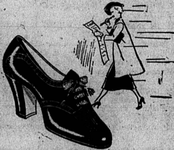
Above is the Newest Thing in Black Tie Oxfords, $2.45