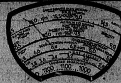
Section of new Spread-Band Dial on the Philco 116X DeLuxe