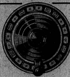
We will replace the mythical call letters illustrated with those of your favorite stations.