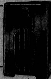
New PHILCO 116X DeLuxe