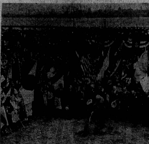
A general view of the ground-breaking ceremonies for Yerba Buena Shoals where the buildings of the 1939 Exposition in San Francisco Bay will be constructed. Gov. Merriam of California is the central figure of the ceremony, surrounded by girls representing nations which will sponsor exhibits.

Torrance Herald Want Ads Reach More Than 25,000