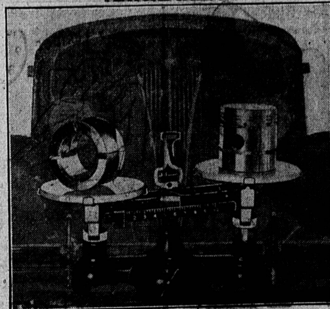
The big Ring-True bearing used in Hudson-built cars outweighs the aluminum alloy piston from the same car almost 2 to 1. Light reciprocating parts plus big bearings are a tremendous factor in producing the smoothness, fine performance and long life of the car.

Heavy bronze-backed, babbit-lined bearings and aluminum alloy pistons are a combination which is largely responsible for the fine performance and endurance characteristics of Hudsons and Terraplanes. The big Ring-True bearings with their heavy cast-bronze backs and babbit linings spun into place used in these cars are outstanding in the industry.