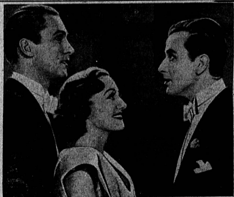
Brian Aherne, Joan Crawford, Fred Keating in "I Live My Life"

Brian Aherne and Fred Keating vie for Joan Crawford's favors in the scintillating Metro-Goldwyn-Mayer star's newest picture, "I Live My Life," shown Sunday and Monday at the Torrance Theatre. The story revolves about the romantic relationship between a society girl and a hard-headed archeologist.