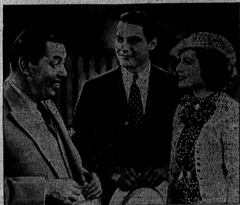
In his new Fox film, "Charlie Chan in Shanghai," WARNER OLAND is called upon to solve a mystery that baffles the secret service of two nations. He is seen here with IRENE HERVEY and CHARLES LOCHER who play the romantic leads.