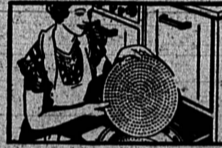
ASTOGRIL Rotor-Disc Broiler