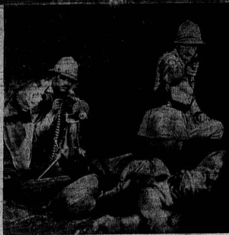
Cary Grant and Claude Rains as they appear in one of the thrilling scenes in Paramount's "The Last Outpost," adventure story of British fighting men in the Sudan desert, at the Torrance Theatre Tuesday and Wednesday.