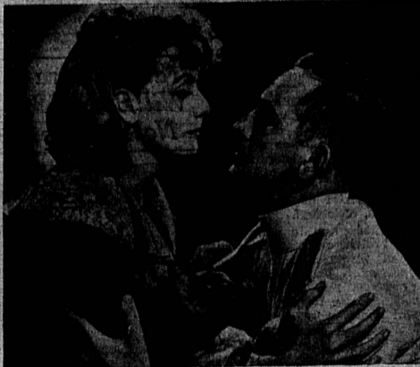
Greta Garbo and Fredric March in "Anna Karenina"