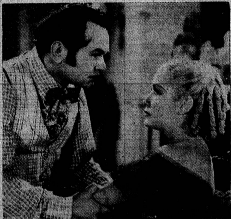
Edward G. Robinson and Miriam Hopkins in Samuel Goldwyn's production "Barbary Coast," released through United Artists.