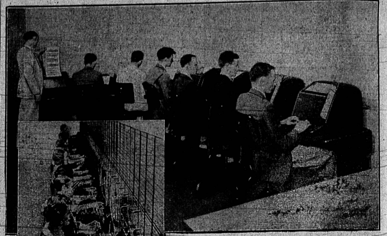
Above: The Teletype Division of the Communication Section of the Federal Bureau of Investigation, U. S. Department of Justice, Washington, D. C. In addition to the four teletypewriters shown here, there are similar machines in 36 field offices of the Bureau of Investigation which can be reached almost instantly for two-way wireless communication. Left: Operators at a Bell Telephone System teletypewriter switchboard, where teletypewriters are connected by wire just as telephones are connected through a telephone switchboard.