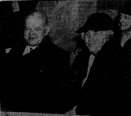
Forgetting politics for the moment, former President Herbert Hoover and his wife attended the Stanford-University of Southern California football game at Los Angeles Nov. 9. The former President was well pleased with his alma mater's 3 to 9 victory over U. S. C.

Politics Comes First TOLEDO, (U.P.)—Official and campaign duties called members of the city council finance committee on the same night. A scheduled committee meeting was called off.