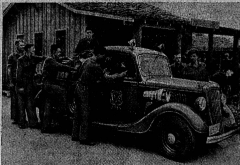
Members of the Civilian Conservation Corps camp at America's Exposition inspect the new Ford V-8 fire truck upon its delivery. The design and equipment were developed by the United States Forest Service under the Department of Agriculture.

A specially designed and equipped Ford V-8 truck has been delivered to the Civilian Conservation Corps camp at America's Exposition in Balboa Park, San Diego. It will be used by trained members of the corps in demonstration of fighting forest fires and as auxiliary fire protection for the Exposition buildings. Equipment for the Ford truck has been developed by the United States Forest Service under the Department of Agriculture. The truck is equipped with a special pump run by the motor and has an 80-gallon water tank. The truck is capable of drafting water from streams and reservoirs. The pump will throw 20 gallons of water per minute when the motor is turning over at 1750 revolutions per minute and 15 gallons when the motor is idling. The truck also carries 300 feet of one-inch hose, supply of shovels, axes, back pack pumps and a radio. It is the same type of truck that is used in National Forests in California. Each Ranger Station in the National Forests is equipped with a big tank truck carrying 500 gallons of water and 2000 feet of hose. A smaller tank truck similar to the one at the CCC camp. This combination provides fast attack on the forest fires and has been the means of reducing the burned area in the National Forests of California. The small tank truck, such as the Ford V-8, always leaves first for the fire as it can make a fast run and control the fire until the big tank truck arrives with its extra supply of water and equipment.