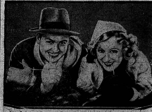
Robert Allen and Grace Moore in "Love Me Forever" A Columbia Picture

Many reasons have been given by persons who went to the theatre two and three times to see Grace Moore in "One Night of Love." Most of them said they had gone because of Miss Moore's beautiful singing. Others said the picture as a whole was grand entertainment.