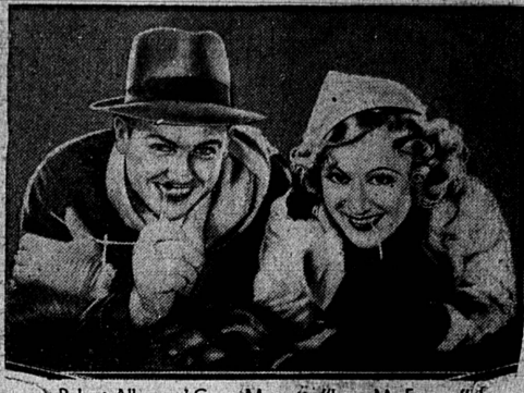
Robert Allen and Grace Moore in "Love Me Forever" A Columbia Picture

While no attendance figures are available, and since the picture is still establishing box office records in smaller theatres throughout the country, it is admitted that Grace Moore's first Columbia production, "One Night of Love," has been seen by more persons than any other picture of the past decade.