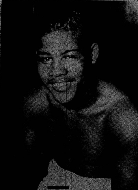
It must have been a very funny joke, or perhaps just anticipation, that made Joe Louis, the Detroit Bomber, break out into a smile like this. Can Max Baer change that smile? Quite a few people are waiting to find out.