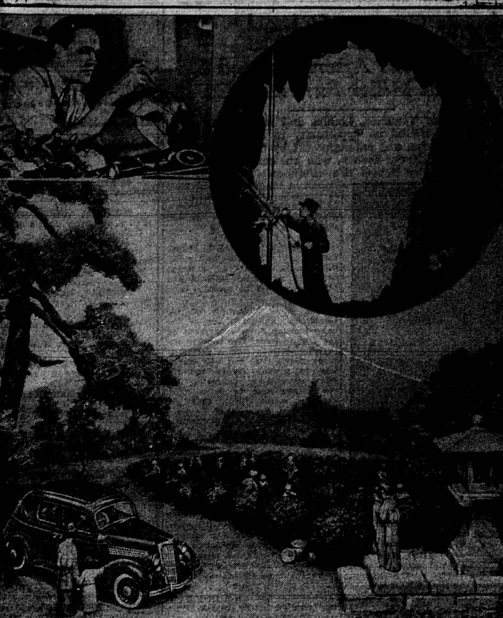
At the top, left, is a close-up of diorama manufacture as carried out in the making of the Ford Exposition building diorama. W. E. Wagner is shown carefully measuring a part of the Ford model V-8 included in the Japan diorama in the rotunda of the building at Balboa Park, San Diego. Note the Japanese figures featured to the right of the car. Upper, right, diorama in the Ford Exposition building depicts the mining of sillimanite high above the clouds. An unusual effect is obtained by a model made of wood and a dill, parts of which are metal and paris wood finished to resemble metal. The large photograph directly above is of the finished Japan diorama after its placing in the Ford Exposition building. The car on which Mr. Wagner is shown working in the upper photograph is completed and in the diorama is placed in the left foreground.

The making of dioramas is an art in itself, according to Henri Marchand, of the Diorama Corporation of America, who supervised the making of models and the painting of dioramas for the Ford Exposition Building, Balboa Park, San Diego. From 25 to 30 men worked at the task of diorama making for three months prior to the completion of the Ford Building. The first step in assembling a diorama is the preparation of a sketch showing the size, color and shape of the proposed painting. Then a wooden panel is erected and the back is painted according to the design. When this is done, the figures in the foreground are made in full relief and set in place. From this state on the process is one of blending colors and figures between the intervening spaces so the illusion of distance and full perspective is obtained. Cardboard models are used for size and contour. The trial and error system results in perfect blending of colors and true perspective. Dioramas are made in a dark room with only the lights which will be installed in the back of the