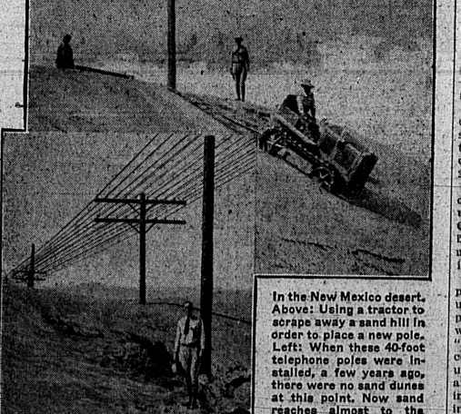
In the New Mexico desert. Above: Using a tractor to scrape away a sand hill in order to place a new pole. Left: When these 40-foot telephone poles were installed, a few years ago, there were no sand dunes at this point. Now sand reaches almost to the cross-arms of the poles in the background.

From an elevation of 7,623 feet where it enters the State of New Mexico over the Raton Pass, to the lowest point of the line at El Paso, Tex., where the elevation is 3,780 feet, the telephone line between Denver, Colo., and El Paso rises and falls 3,843 feet within the 550 miles of its route within New Mexico.