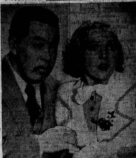
WARNER OLAND and PAT PATERSON have the leading roles in Fox Film's latest mystery thriller, "Charlie Chan in Egypt." Charlie Chan faces a new enemy and strange conditions in this, his most baffling case.