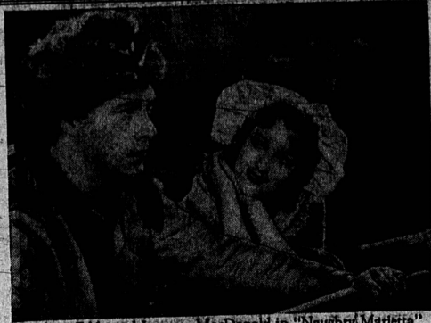
Nelson Eddy and Jeanette MacDonald in "Naughty Marietta"