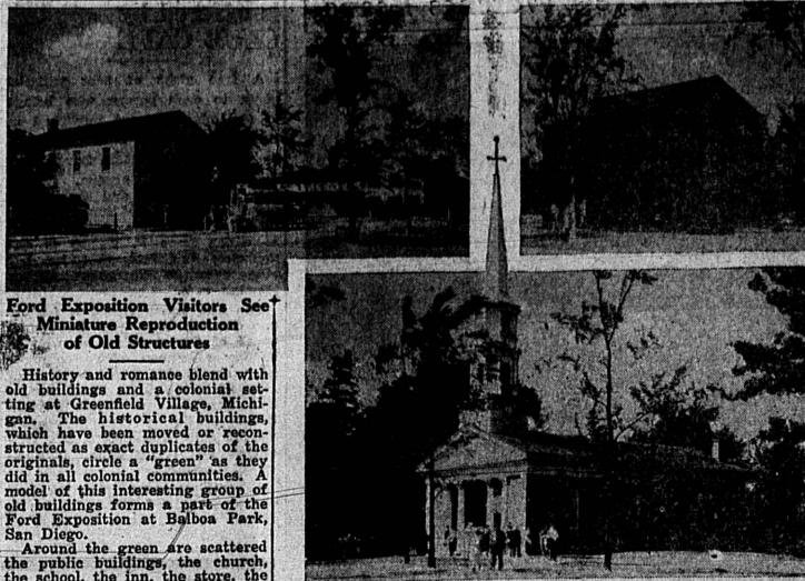
Ford Exposition Visitors See Miniature Reproductions of Old Structures

History and romance blend with old buildings and a colonial setting at Greenfield Village, Michigan. The historical buildings, which have been moved or reconstructed as exact duplicates of the originals, circle a "green" as they did in all colonial communities. A model of this interesting group of old buildings forms a part of the Ford Exposition at Balboa Park, San Diego.