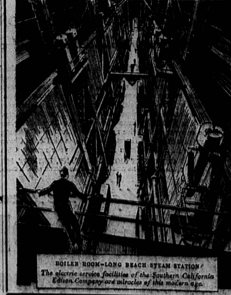
BOILER ROOM—LONG BEACH STEAM STATION The electric service facilities of the Southern California Edison Company are miracles of this modern age.

"Our industrial leaders may be personified by Henry Ford, who said on this subject, 'The location of a new industrial plant is largely determined by the cost of its power and the price at which it may be made and ship goods. As far as possible we locate all our plants on the water and on inland waterways. It is less expensive to load boats than freight cars.' "The future of Southern California depends on industrial expansion. We have every opportunity for economically providing a modern, commodious and ideal industrial harbor, and now is the time to act."