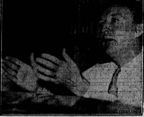
The candid camera was on the job when Senator Hugo Black, chairman of the Senate lobby investigating committee, questioned a witness regarding the burning of records of the lobbying activities of the Associated Gas & Electric Co. during the lobby hearing at Washington.