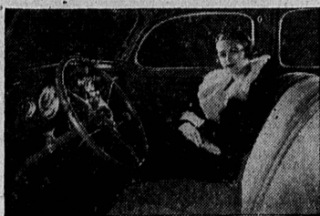
You will find beauty in the new Ford V-8 interior, characteristic of custom built cars

OUTSIDE and inside the new V-8 strikes a new note in modern design and beauty. It is gracefully streamlined from its slanting radiator grille to rear bumper. You have your choice of attractive body colors in durable baked enamel finish. Fenders match the body at no extra cost. Interiors are newly designed and luxurious with quality upholstery. In addition to appearance, Ford brings you the fine car performance of the only V-8 engine in any car selling for less than $2300. See the new Ford V-8 today. If you drive it, you will buy it.